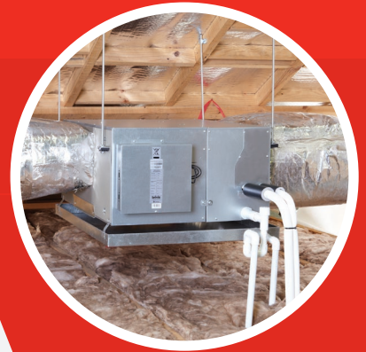
Indoor Fan Coil Unit installed within a roof space