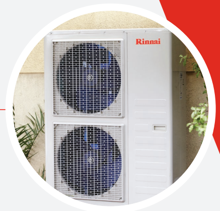
Outdoor Condensing Unit

For illustrative purposes only A typical installation includes a system of insulated duct work distributing conditioned air throughout the entire home.